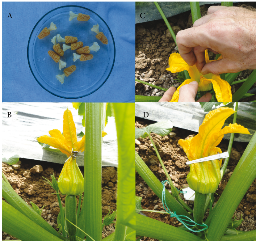
Figure 1. A) Male squash flowers in glass petri dishes for irradiation, B) isolation of female flowers in pens to prevent open pollination, C) pollination of female squash flowers with irradiated pollen of male flowers, D) closing of pollinated female flowers in pens to prevent pollen contamination.

year, 8 genotypes selected from these 14 genotypes were tested. The 8 genotypes were selected according embryo number obtained per fruit. Seeds were planted in plugs (peat and perlite, 2:1) at the Horticultural Research and Application Area of Çukurova University. Seedlings were then transferred to a plastic greenhouse with 1 × 1.75 m spacing. Throughout the growing period normal horticultural cultivation practices were implemented. Male flowers were collected the day before anthesis and put into glass petri dishes for irradiation. On the same day, female flowers were closed with pens to prevent open pollination. Irradiation was performed at the Department of Radiation Oncology, Faculty of Medicine, Çukurova University, with gamma rays from Co 60 . Two different irradiation doses were examined in the first year of the study: 150 Gy and 200 Gy. In the second year of the study, a dose of 300 Gy was added to the experiment. After irradiation, male flowers were kept at room temperature during the night. On the following day, isolated female flowers were pollinated with irradiated pollens, and the pollinated female flowers were closed with pens to prevent pollen contamination until fruit setting (Figure 1).