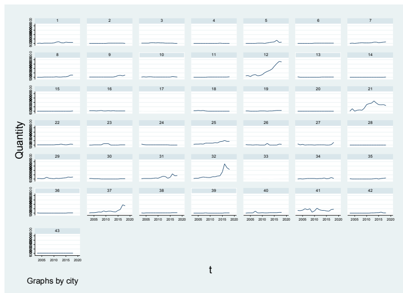
Figure 3. Distribution of total production value for each province by years

According to Figure 3 , although 8, 9, 12, 21, 25, 27, 29, 31, 32, 37 and 41 provinces have increased year by year, there is a very limited increase over the whole time period (2003-2018). The increase in provinces 12, 21 and 32 has a significant upward trend over the period of time.