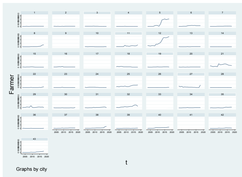
Figure 4. Distribution of the number of farmers by year for each province

Descriptive statistics of the parameters used in the study are given in Table 1 .