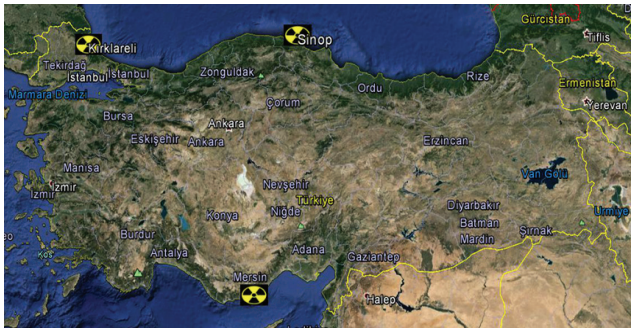
Fig. 3. The nuclear reactors are planned to be established in Turkey [12]

construction and operating licenses for the first plant, at Akkuyu, and construction start is expected in 2018.A Franco-Japanese consortium is to build the second nuclear plant, at Sinop. China is in line to build the third plant, with US-derived technology. A small uranium mining project is planned [9].